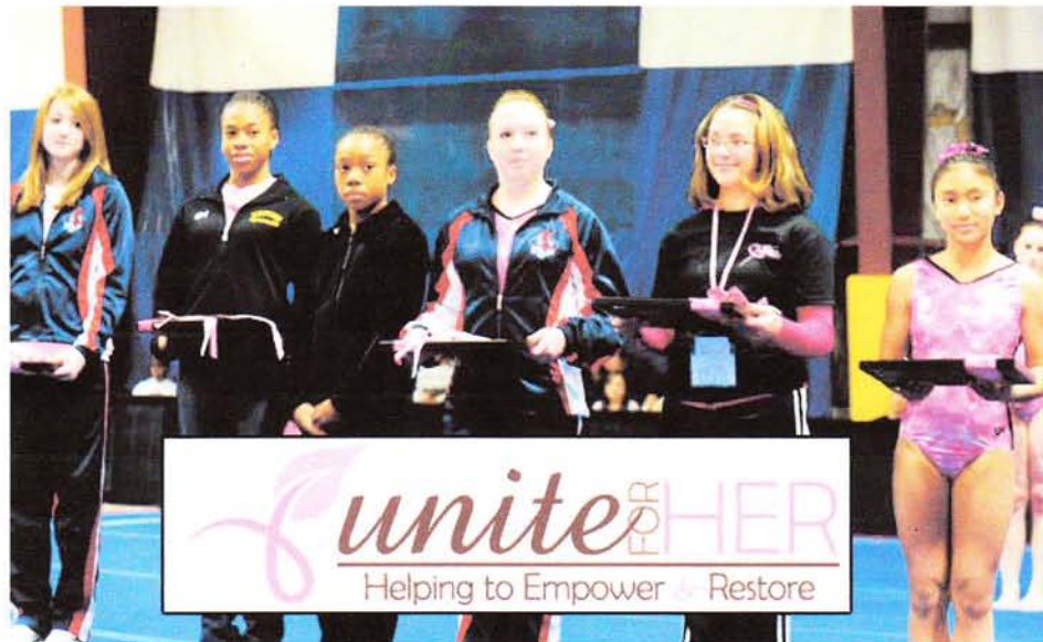
The 2010 Gymnasts Unite Grant recipients are honored at the Pink Invitational event.